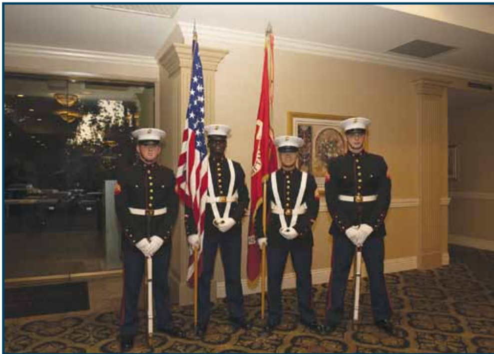
The Piper & The Color Guard Opened the Ceremony