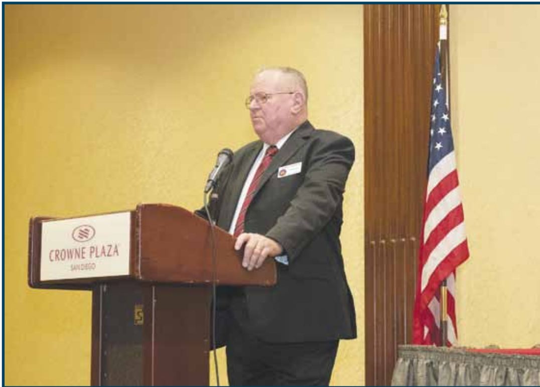
A Time for Speeches