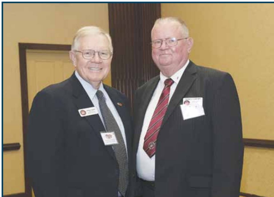
Thank you, Mr. President. Congratulations, Mr. President