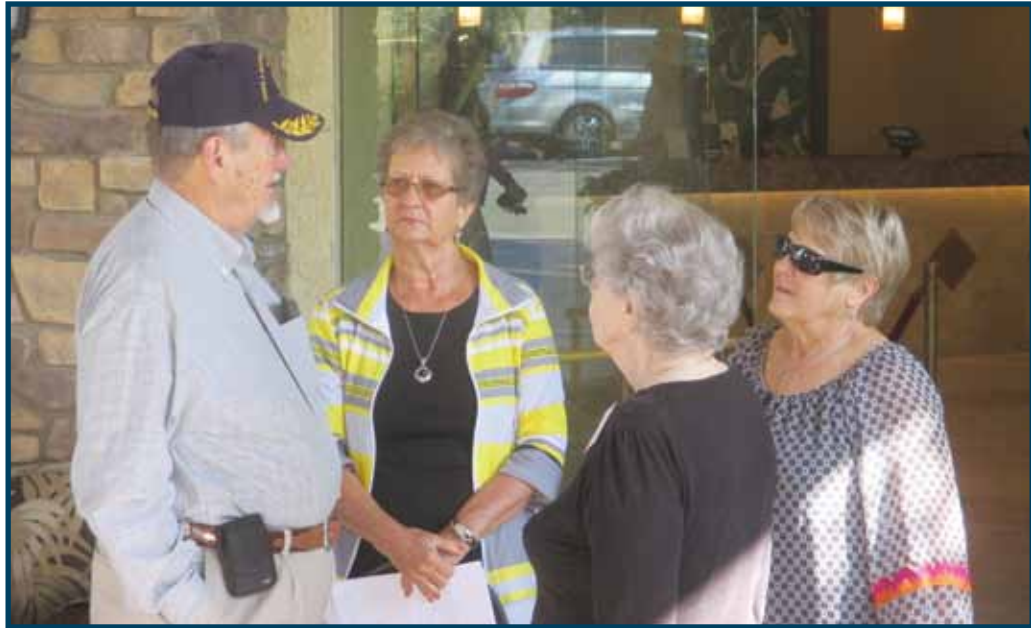
Hurry Up and Wait!

Reunion attendees had the opportunity to attend the 2018 Air Show hosted by Marine Corps Air Station Miramar, California featuring the Blue Angels