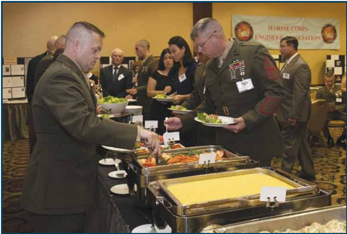
The Meal was Delicious and Plentiful