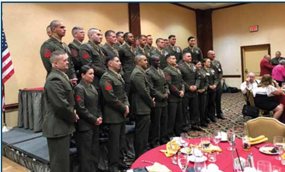
Recognizing the Awardees