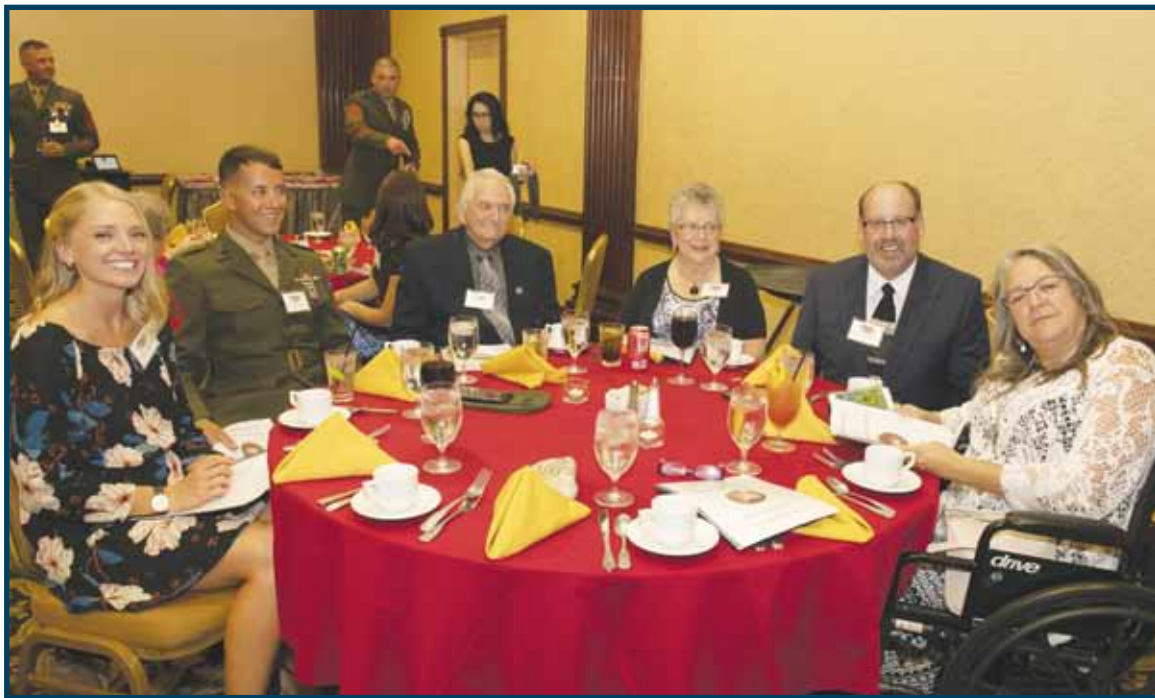
Friendships were Made and Renewed