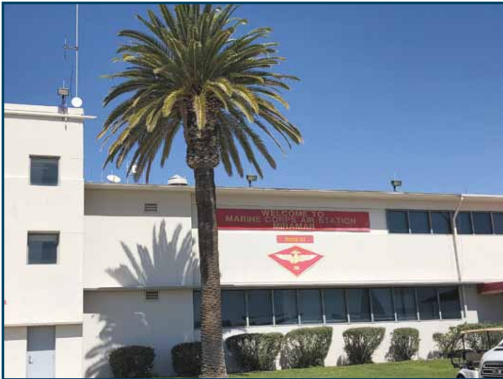
Welcome to MCAS Miramar