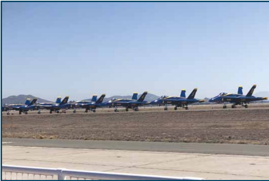
The Blue Angels