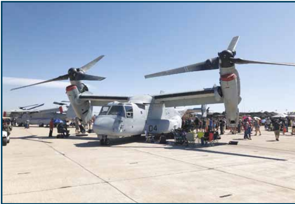
“New Breed” Marine Corps Aviation