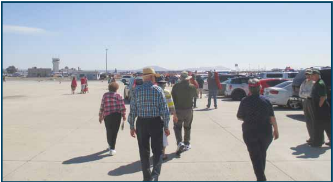
A Beautiful Day for an Air Show